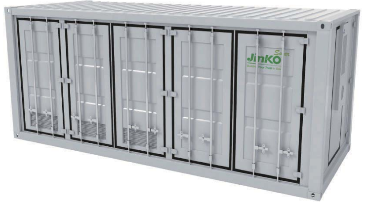
500kW-504/945/1215/1620kWh-solution internal component

JKS540K-500H JKS810K-500H JKS945K-500H JKS1080K-500H JKS1215K-500H JKS1350K-500H JKS1620K-500H